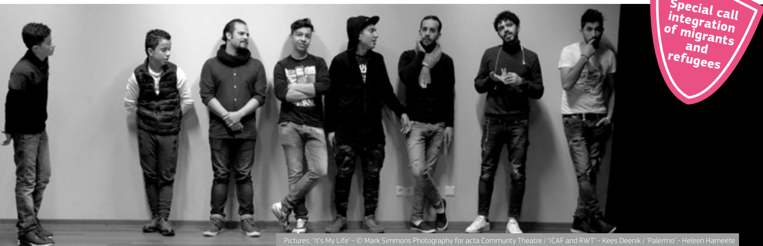
Pictures: 'It's My Life' - © Mark Simmons Photography for acta Community Theatre / 'ICAF and RWT' - Kees Deenik / 'Palermo' - Heleen Hameete

Special call integration of migrants and refugees