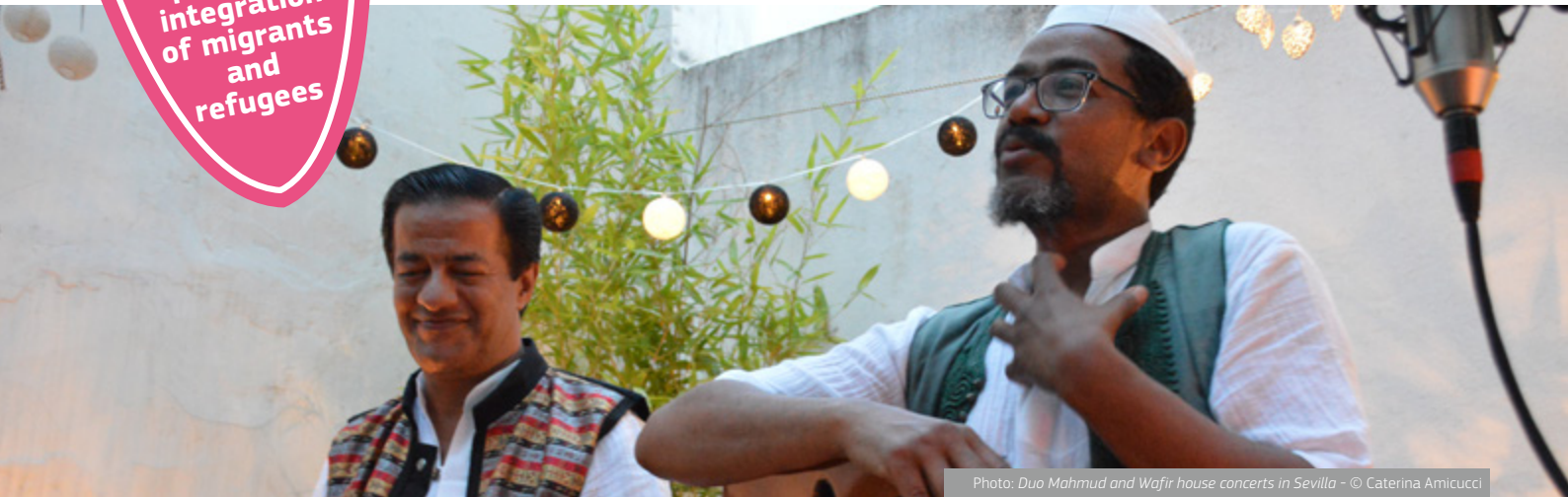
Photo: Duo Mahmud and Wafir house concerts in Sevilla