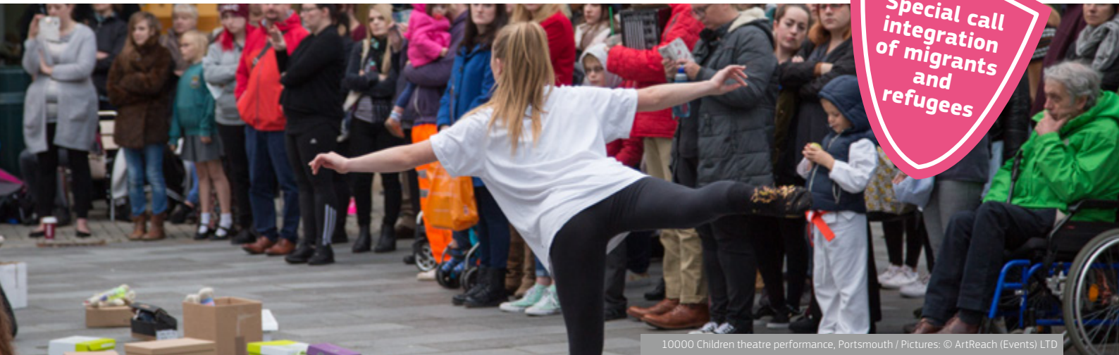
10000 Children theatre performance, Portsmouth

Special call integration of migrants and refugees