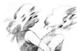
© Reza Hazare, Exile series (one of the artists participating in the project)