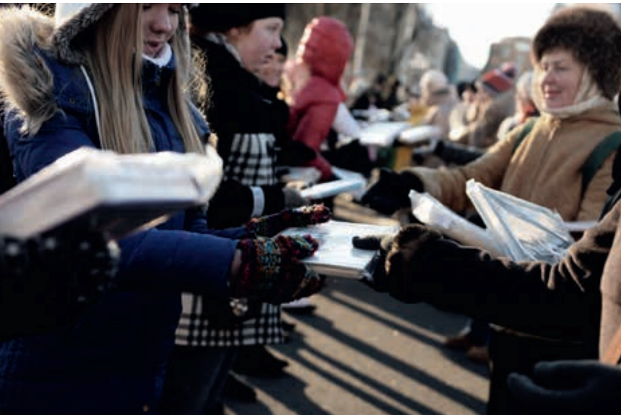
Riga 2014 — Chain of book lovers

During its evolution, the programme has encouraged a stronger commitment towards more closely-defined and locally-sensitive vision statements. It is important that the programmes not only correspond to the ambitions of the planners but also sit comfortably with the city's own population. This requires an acute consciousness of local culture — in every sense of the word — to ensure that the content of the programme and the creation or import of new cultural activities win the support of local communities, rather than generate disruption and associated tensions.