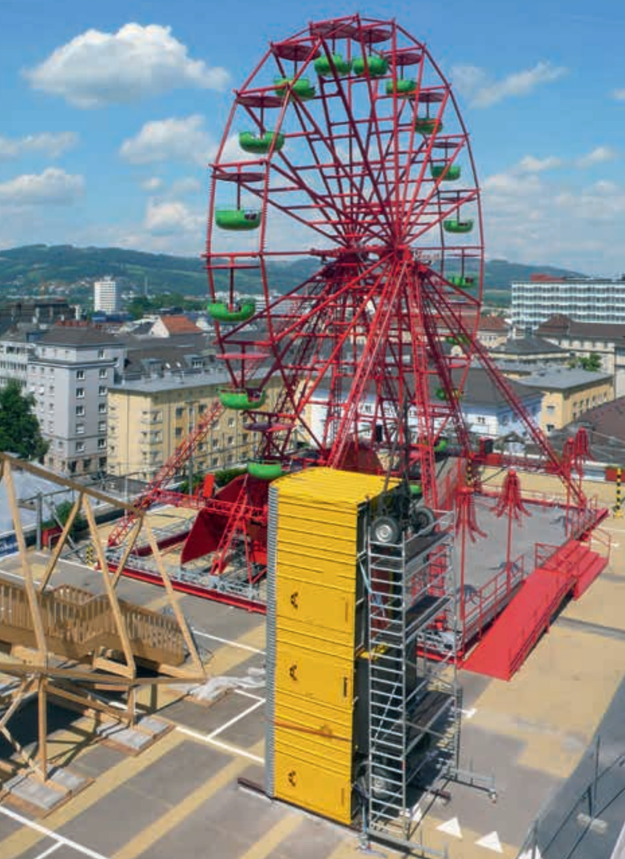
Linz 2009 — Andreas Strauss — 90° Kiosk, 2007/ 2009 at Höhenrausch 2009