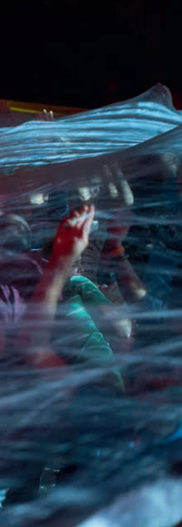
Guimarães 2012 — Renascer 'Time to be reborn'

the initiative has fostered the development of an aspirational vision that goes beyond celebration, and embraces transformation. Being a European Capital of Culture has become a catalyst for a wider change in the perception of a city — both by its own residents, and by the world beyond.