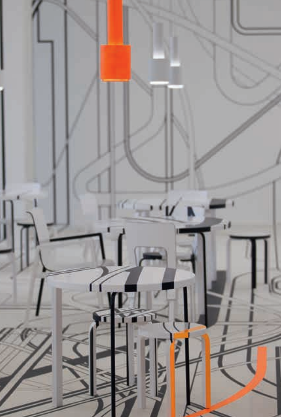
Turku 2011 — Logomo Café 'Nothing happens for a reason' by Tobias Rehberger

European Capital of Culture year was an element — and the culmination — of a long-term engagement for the cultural and creative economy. As a result, this sector now represents some 86 000 employees in more than 10 000 businesses across the Ruhr area — linking culture, urban development and education. The centre, jointly run and funded by local and regional authorities, also with a contribution from the EU Structural Funds, is committed to supporting its components as well as the development of creative locations and spaces.