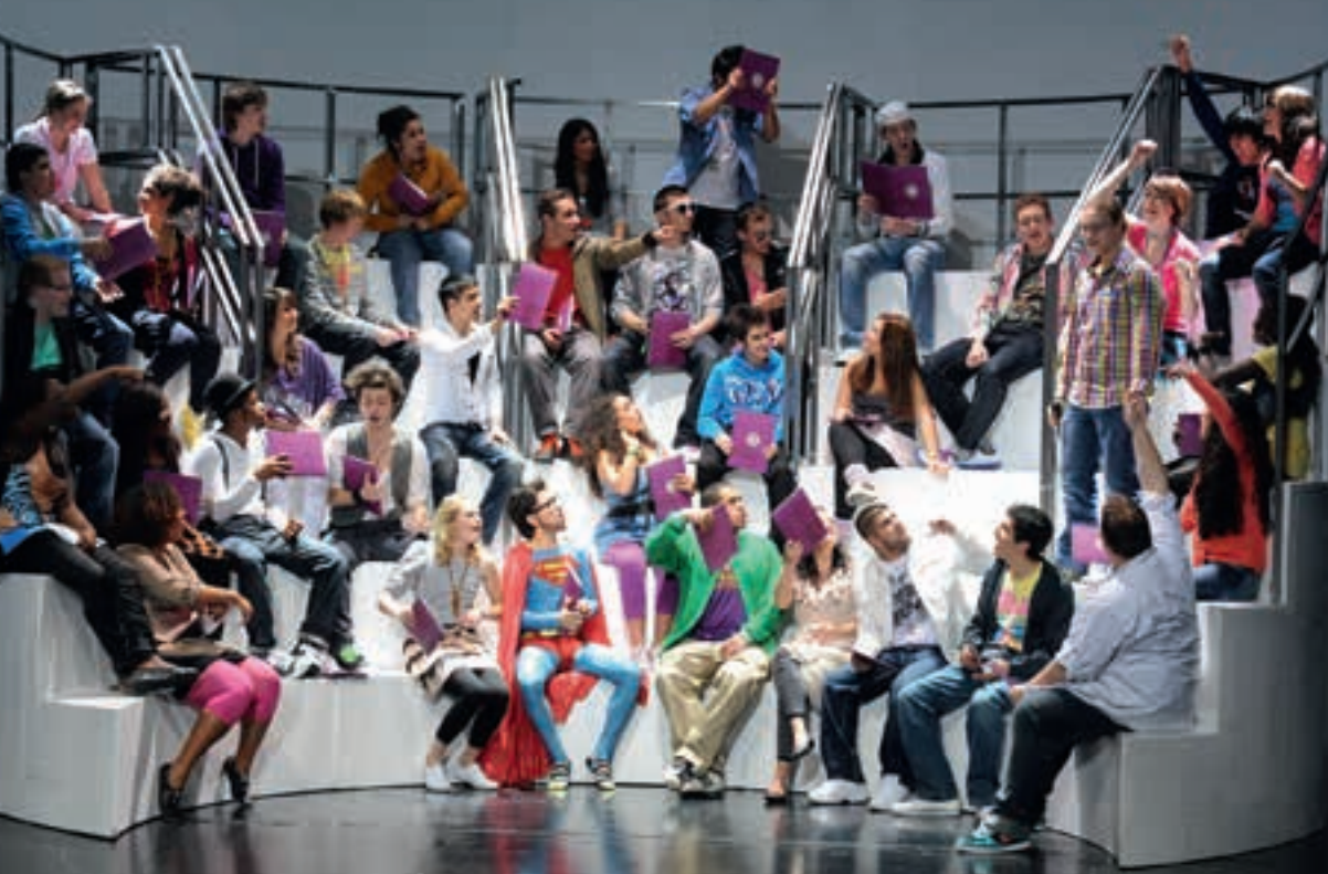
Essen for the Ruhr 2010 — TWINS project, Next Generation